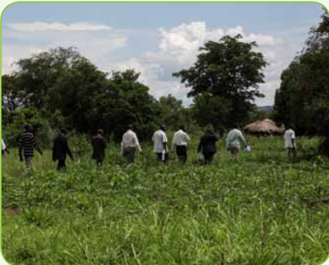
MPs visit beneficiaries at their homes in Kaberamaido