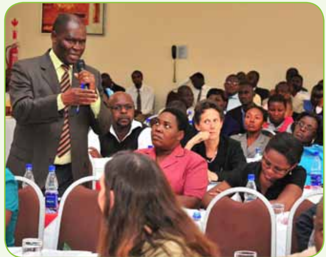
A participant makes a contribution at the ESP/EPRC public dialogue at Protea Hotel in Kampala