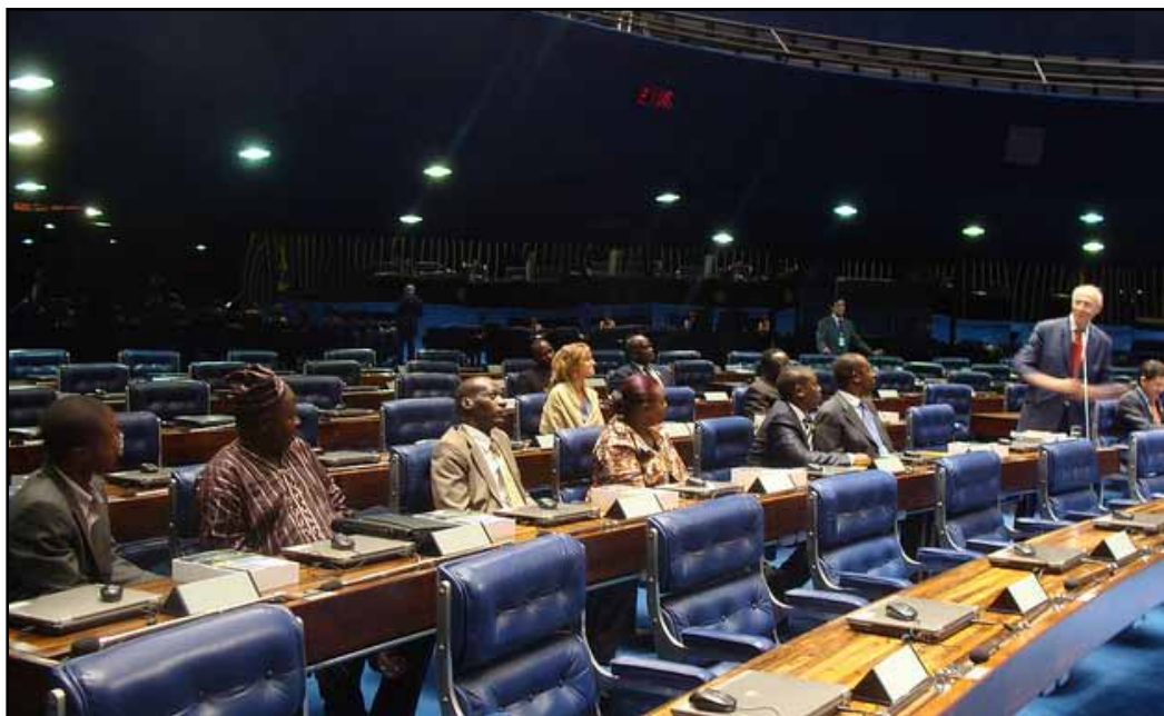
Ugandan delegation being welcomed into the Brazilian Senate.

In a bid to expose Ugandan policy makers and implementers to the immense contribution that a strong social protection system can make towards a country's growth and social-economic transformation, the Social Protection Secretariat recently organized study tours to see some of the well-developed social protection systems in three different countries; Brazil, South Africa and Lesotho.