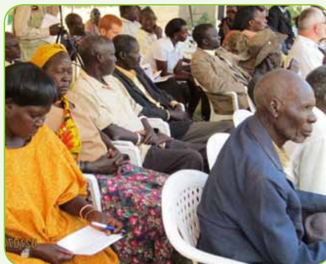
Elders in Karamoja attend a sensitisation meeting on Senior Citizens Grants