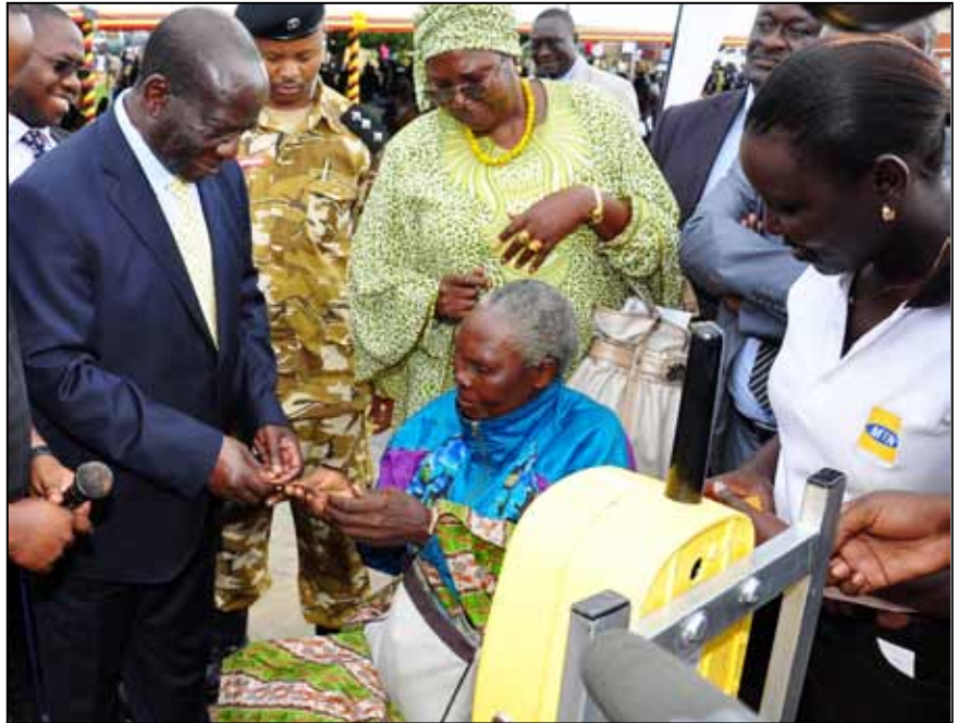
Vice President Edward Ssekandi hands over money to a beneficiary in Kyenjojo

Direct Income Support, such as that provided by the Senior Citizens Grants, addresses vulnerability by ensuring that poor people have the means not only to improve their lives in the short