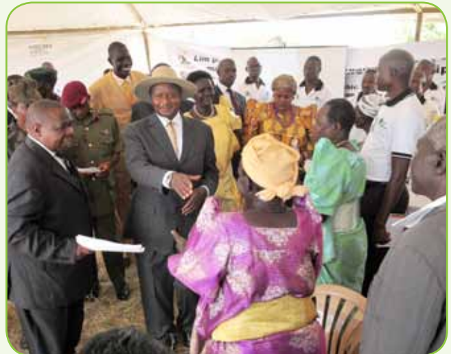
President Museveni greets Senior Citizens Grants beneficiaries in Nebbi