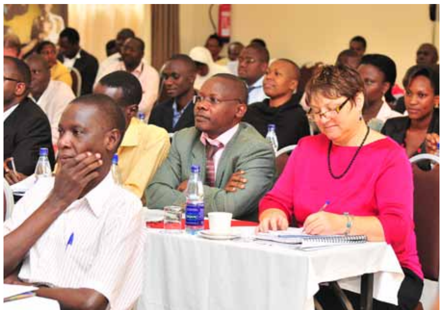
Participants at the dialogue listen to the presentations.

The findings of the studies provide some of the strongest evidence yet, in Uganda, to support Direct Income Support.