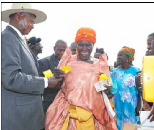
President Museveni in Nebbi