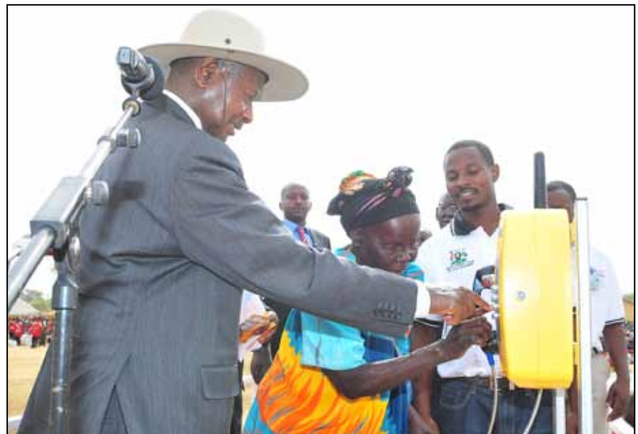
President Museveni helps a beneficiary to withdraw her money during the launch