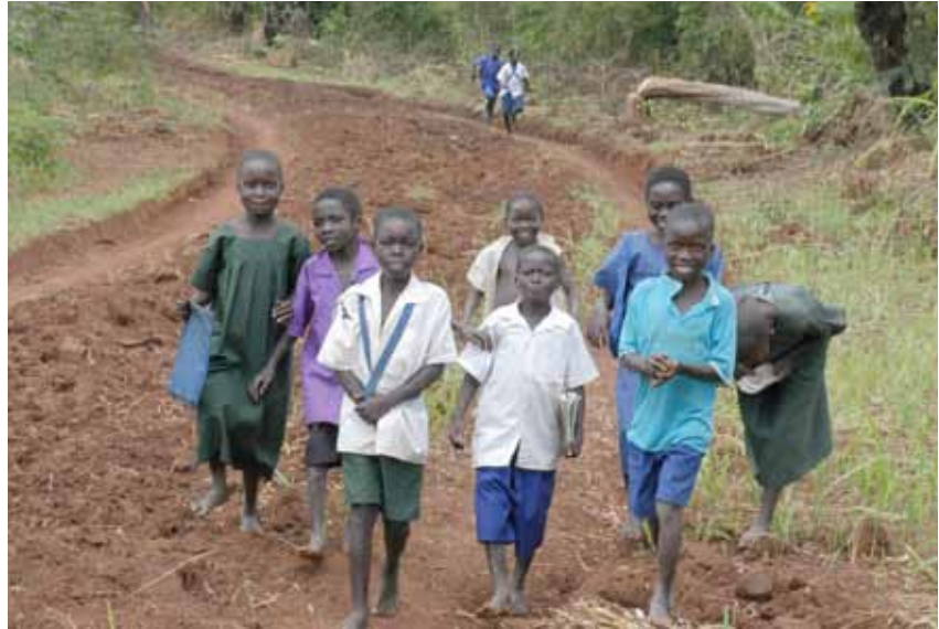
A comprehensive approach to social protection enables the poor to get an education

While the SDIP II places important emphasis on social protection, however, we feel that this is not yet well enough defined. There is a tendency, at conceptual level, to conflate social protection with social development more broadly. A clearer focus on social protection would help to ensure a clear, coherent and robust strategy for developing a national, social protection system in Uganda