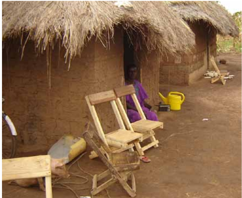
The poorest in Uganda remain highly vulnerable

– as a critical contribution to achievement of the NDP.